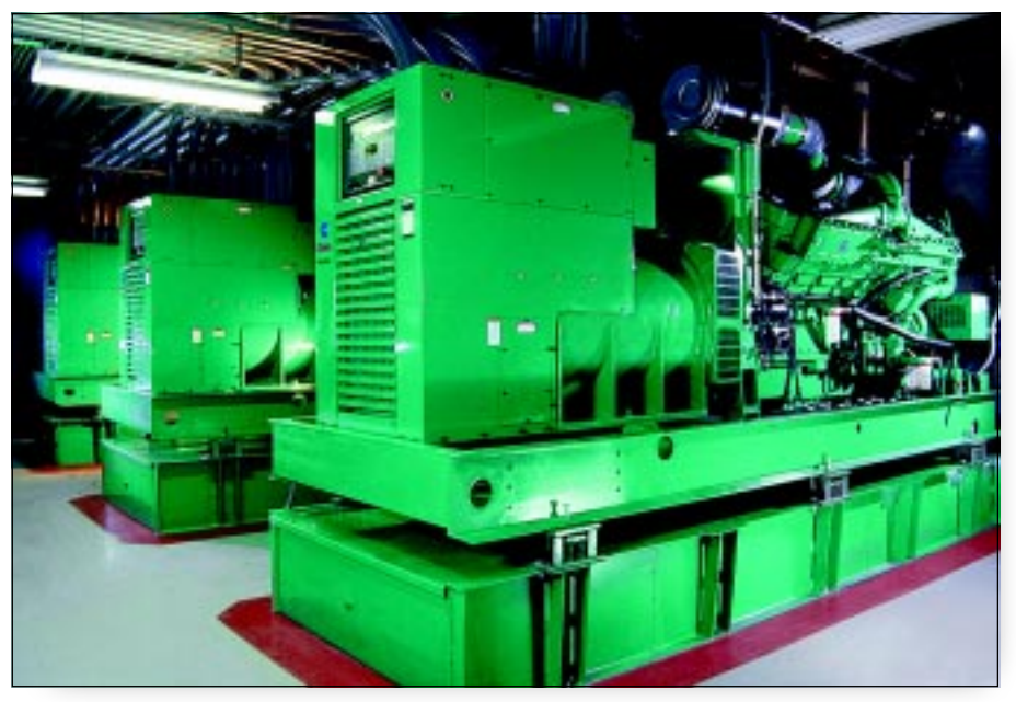
A generator should be sized to 60 percent of actual load, as loads will tend to increase over its lifetime. Proper loading will also increase its lifespan, ensuring a good return on investment.

Sizing the generator to match the load is important. If the load is too high, excessive piston loading can occur along