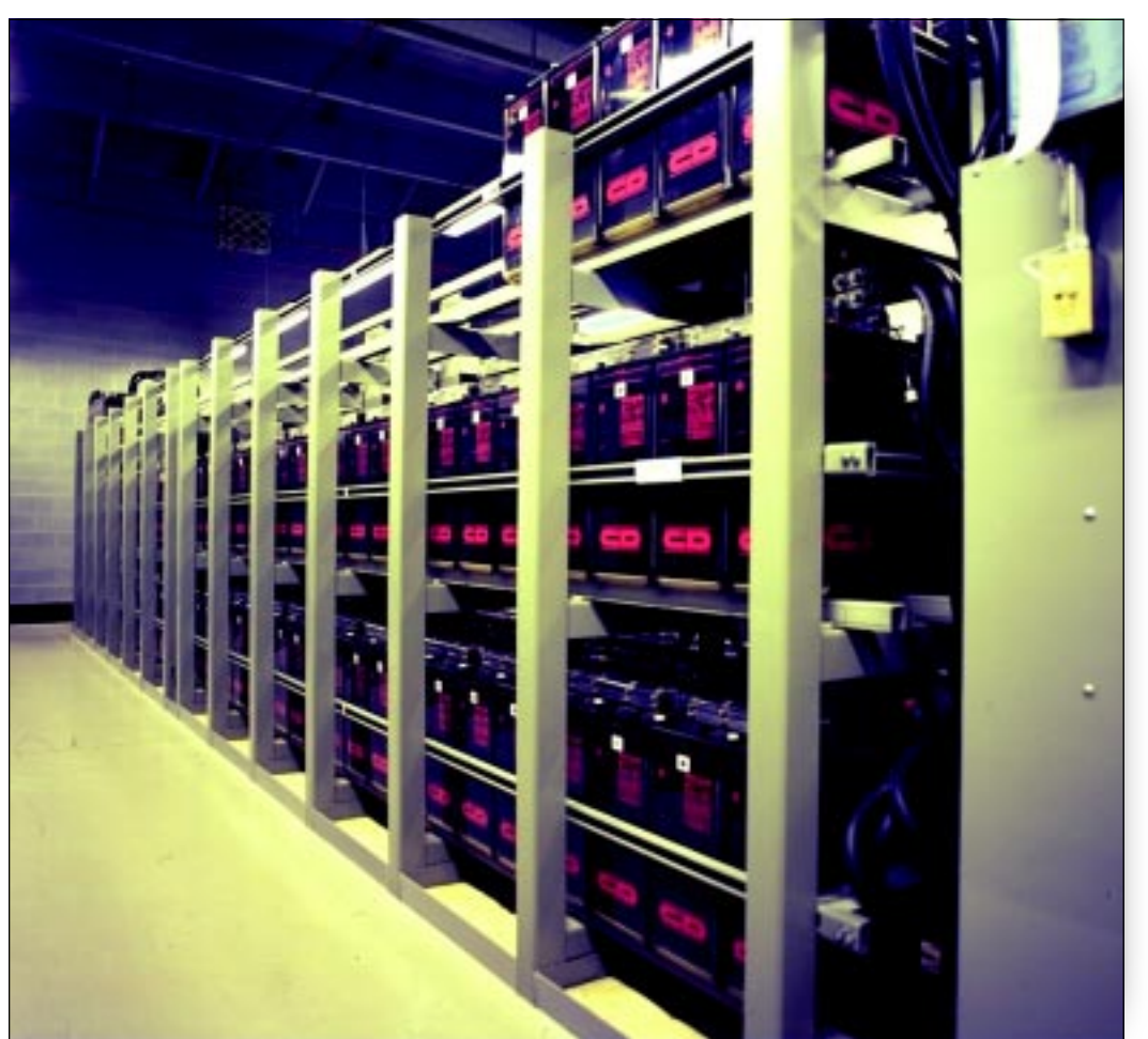
Large battery banks can serve as effective backup or can be used to assume some of the grid load during peak usage periods, a practice called peak shaving .

Power is generated by a number of inductive steps. At one end of the rotor is a set of permanent magnets. The rotation of the rotor induces a small current into a stationary pilot exciter armature mounted on the stator. The output of this armature is rectified and feeds a stationary exciter-feed coil also mounted on the stator. The exciterfeed coil induces power into the rotating exciter armature on the rotor. This